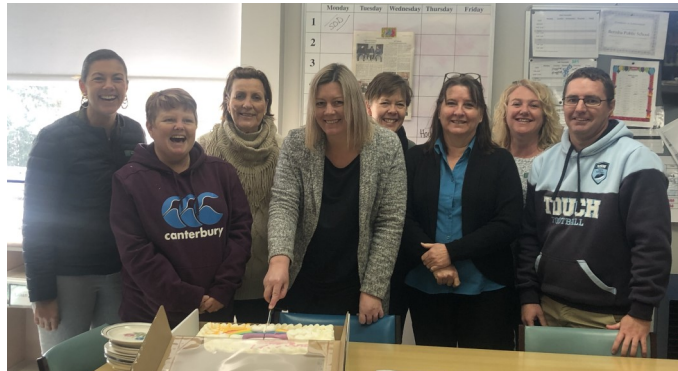
A few of our fabulous SASS staff

This week is School Administrative and Support Staff (SASS) Recognition Week. A time to acknowledge, recognise and thank all of our administrative and support staff. Without the great work that happens in the front office, the commitment and dedication of our Learning and Support Officers in classrooms and the challenging work keeping Berinba PS "looking good", our school would be a poorer place. Thank you to all SASS for the work you do in providing a positive and caring learning environment for all of our students!