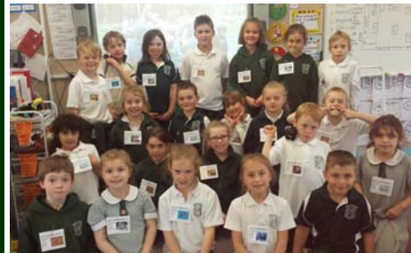
2m - Zoo Keepers for the day

Berinba has started using a new communications tool called Skoolbag which can now be downloaded to any smart phone free of charge. Skoolbag allows the school to instantly update parents with information about the school whilst also allowing parents to notify us of children's absences, change of details etc. Instructions on how to download the app are included in this newsletter. A number of parents are already using the application and the feedback we are getting is very favourable.